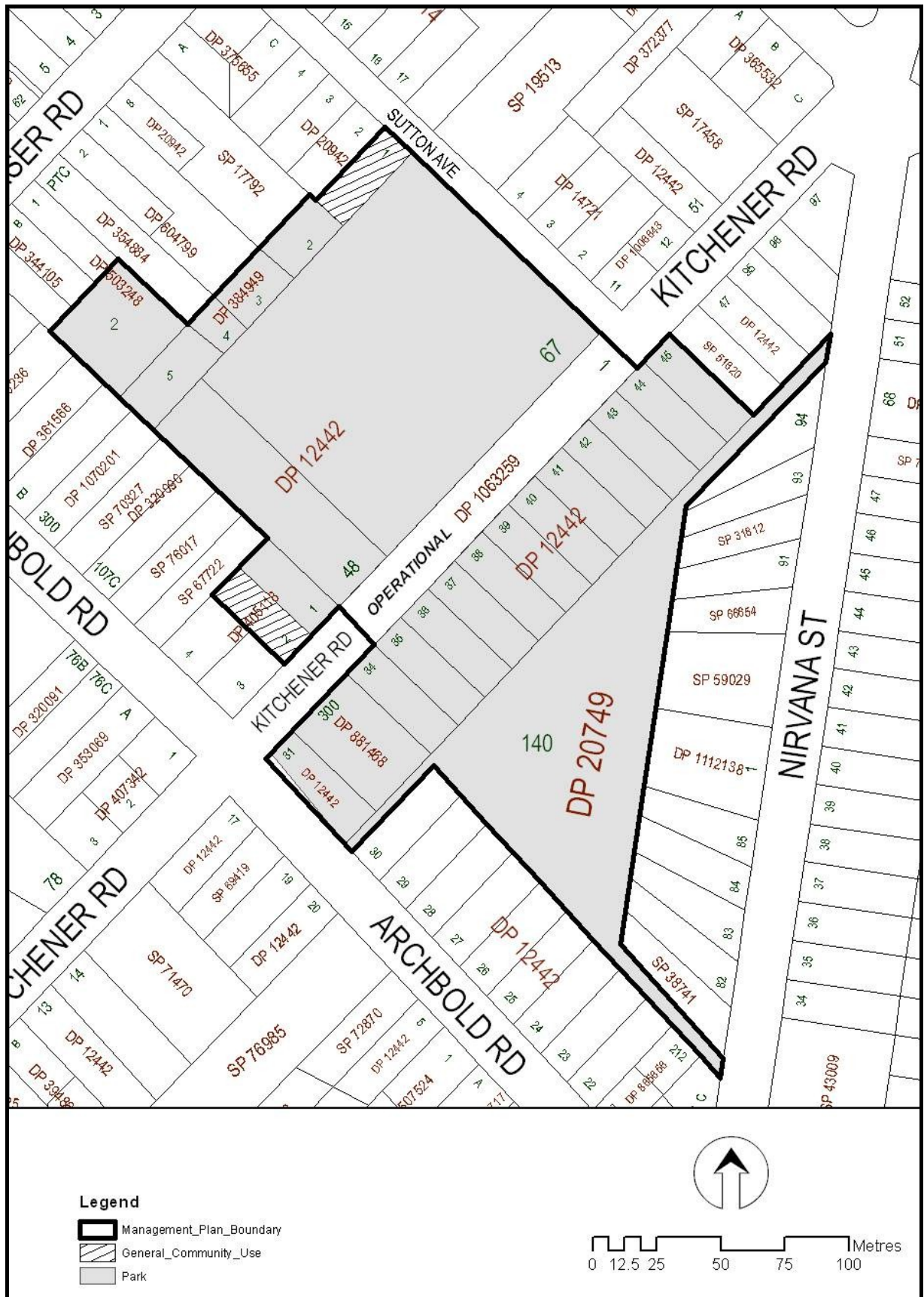
Figure 1 Land Ownership and Categorisation Plan Jubilee Oval Plan of Management