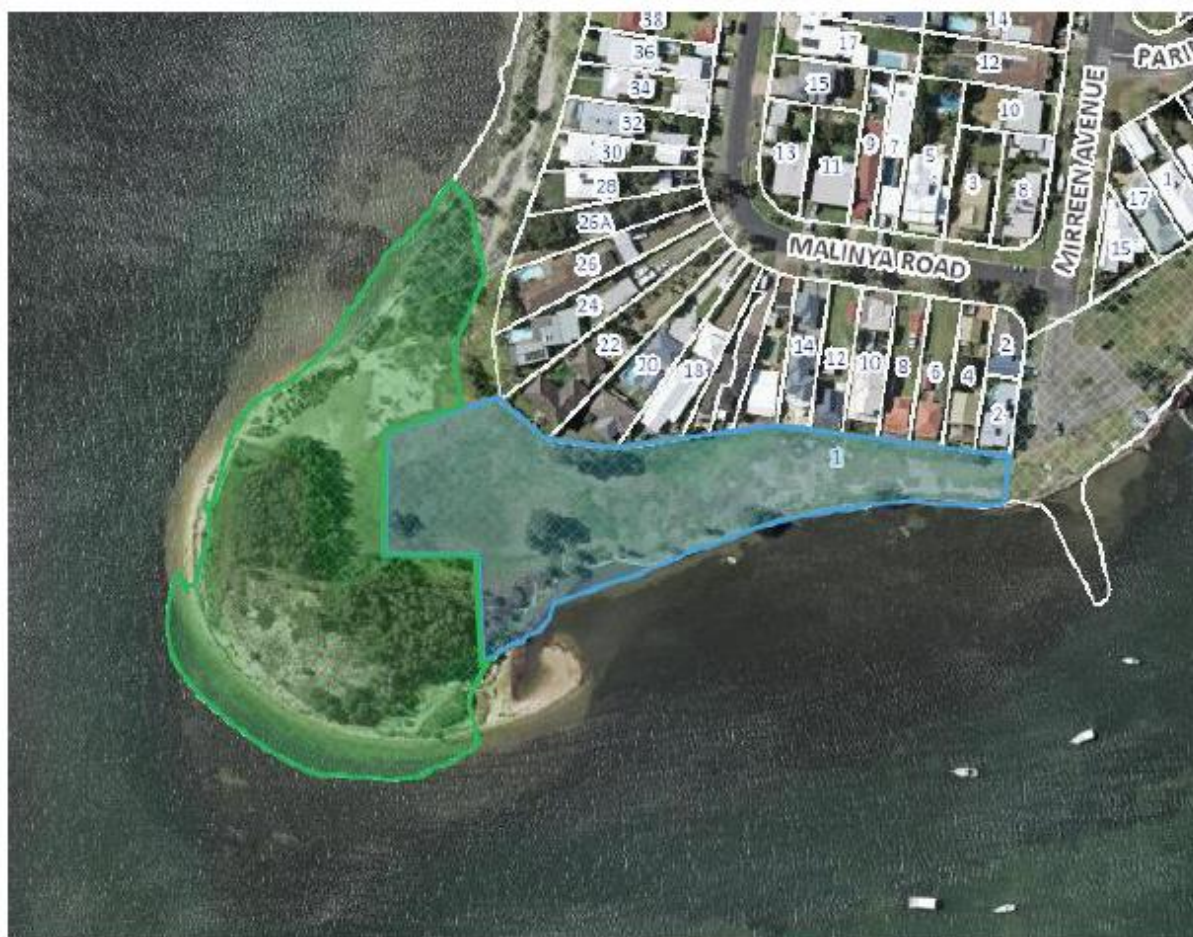
Figure 1 – proposed off leash area at Illoura Reserve, Davistown

Green – revised protected area, Blue – revised OLA, Note: polygons align with Council's cadastre overlays