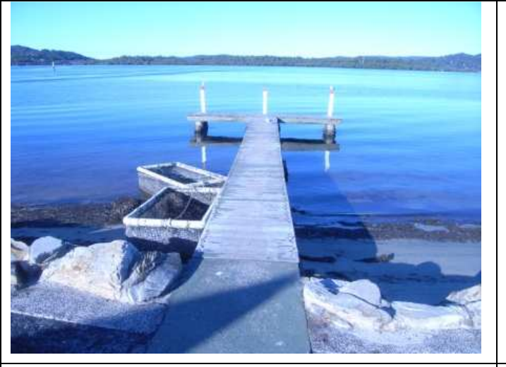
Photo 19: Jetty at Lions Park (at end of North Berge Rd, Woy Woy) showing use of fishing nets. (P48, R31)