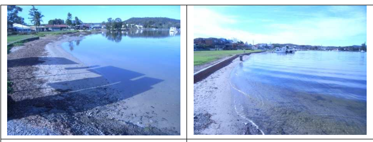
Photo 31: Looking south along foreshore near LinternPhoto 32: Looking east along Illoura Reserve foreshore.<br/>(W56)