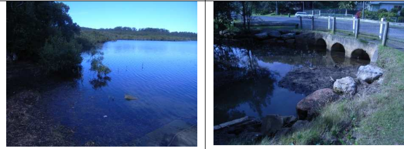
Photo 33: Looking south from Carrak Road towards Kincumber Reserve. (C06) Photo 34: RSL Creek culvert into Hardys Bay. (W23)

Photo 31: Looking south along foreshore near LinternPhoto 32: Looking east along Illoura Reserve foreshore.<br/>(W56)