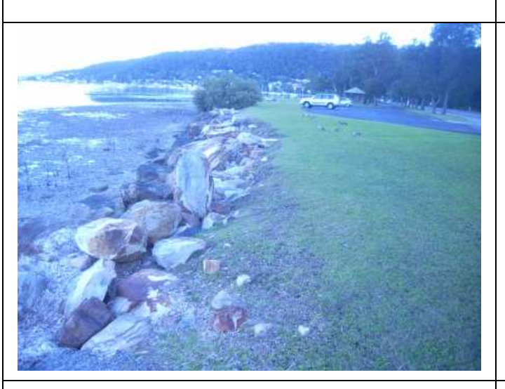
Photo 23: Erosion and rock armour along the Koolewong Foreshore. (W69)

Photo 21: Lions Park boat ramp. (P48, W80, R31)