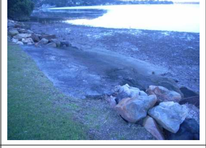
Photo 22: Informal boat ramp at Koolewong Foreshore Reserve. (C14)