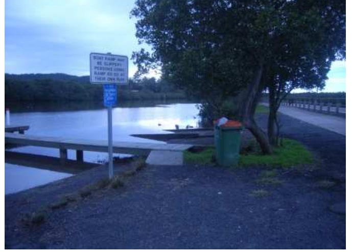
Photo 1: Hylton Moore Park, showing recreation areas and car park facilities. (W01)

Photo 2: Boat ramp and jetty facilities at Erina Creek, looking upstream (north east). (W41, W107)