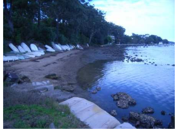
Photo 24: Informal dinghy storage along Masons Parade, Point Frederick (looking south). (W77, W86)

Photo 22: Informal boat ramp at Koolewong Foreshore Reserve. (C14)