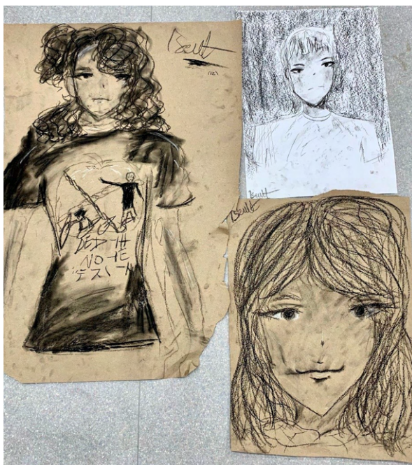
Self - Portrait Charcoal Drawings with Maree