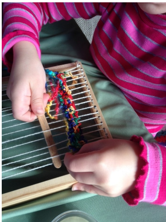
Colour Weaving with Vanja