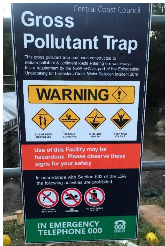
Figure 1: Installed Signage on Wairakei Road, Wamberal

Visible signage has been installed advertising EPA requirement.