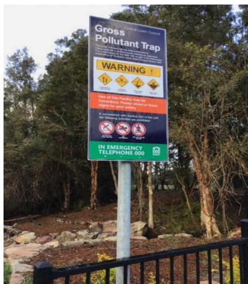
Figure 1: Installed Signage on Wairakei Road, Wamberal

Visible signage has been installed advertising EPA requirement.