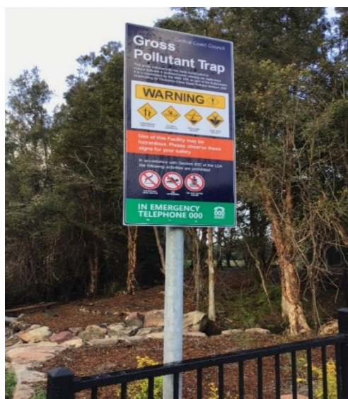
Figure 1: Installed Signage on Wairakei Road, Wamberal

Visible signage has been installed advertising EPA requirement.