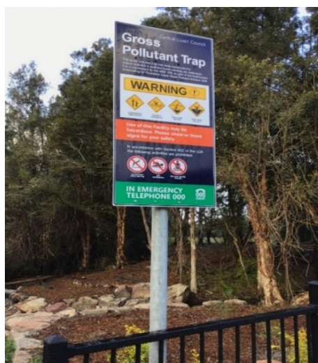
Figure 1: Installed Signage on Wairakei Road, Wamberal

Visible signage has been installed advertising EPA requirement.