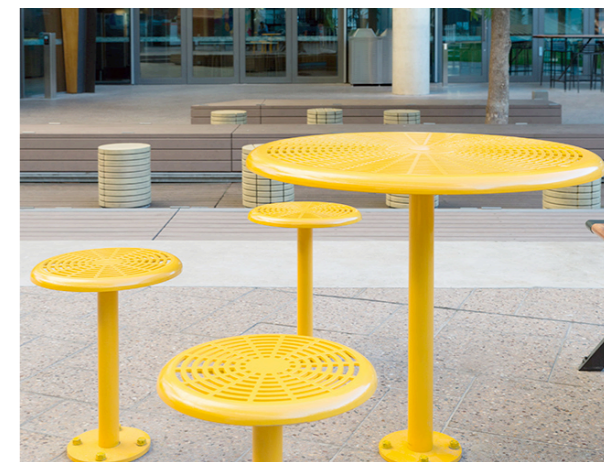
Example setting in proposed colour. 830 ø tables 750h 360 ø stools 450h

Proposed park furniture to be fixed in position. Tables: 12 Stools: 48