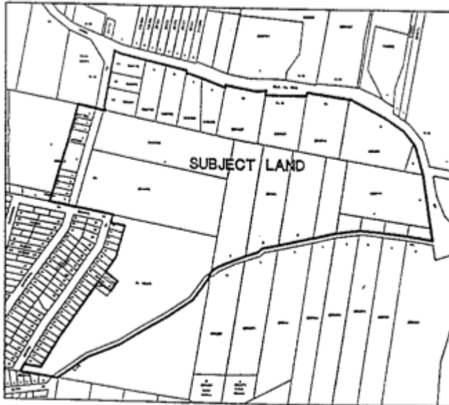
Figure 1 – Land to which this chapter applies

This chapter applies to land bounded by and adjoining Avoca Drive, Elvys Avenue and Davistown Road as shown on the map below.