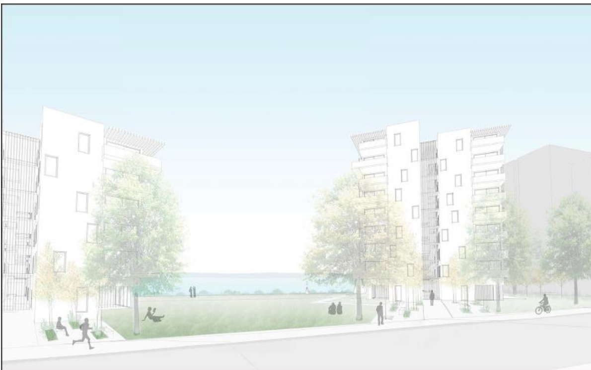
Figure 3: Artists Impression – from Main Road