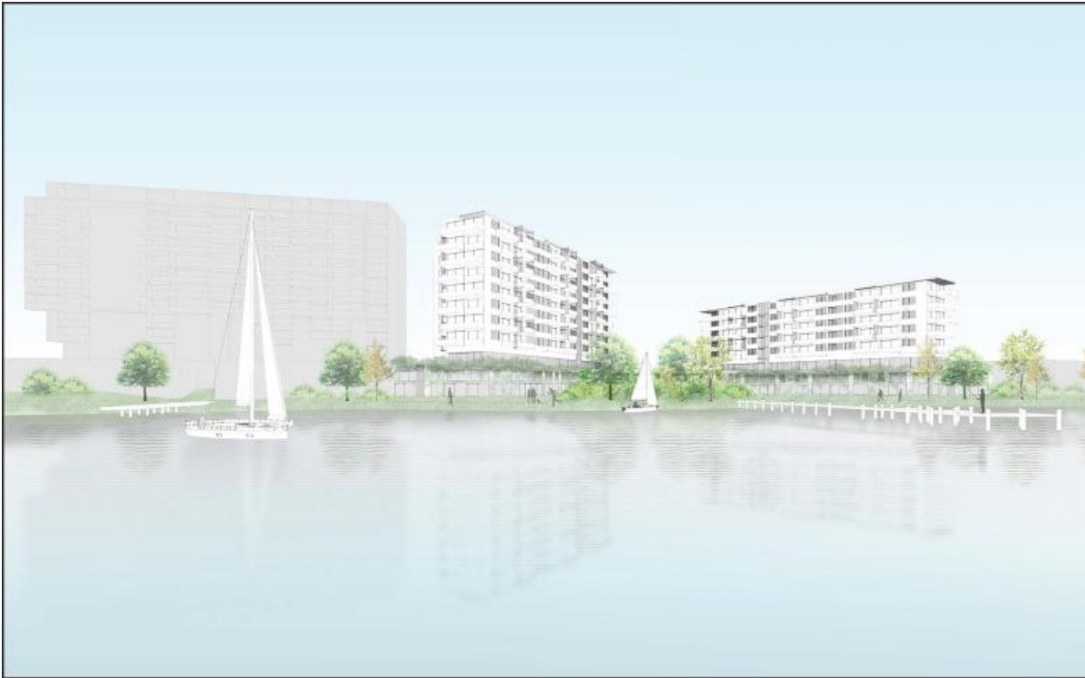
Figure 2: Artists Impression – from Lake Budgewoi