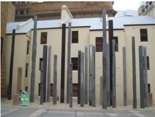
Figure 2 'The Edge of Trees'

The pillars symbolise the 29 Aboriginal clans from around Sydney and include wooden pillars from trees once grown in the area which have been recycled from demolished industrial buildings within Sydney. The work is an example of how public art can provide meaning by connecting modern localities to their cultural heritage.