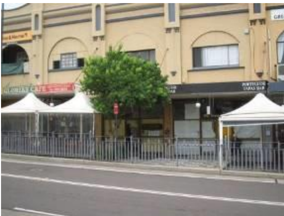
Figure 7 Shop front opposite ceramic mural