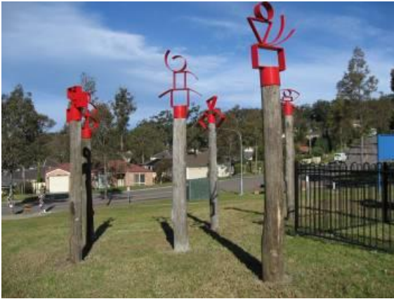
Figure 19 Artist and resident collaboration