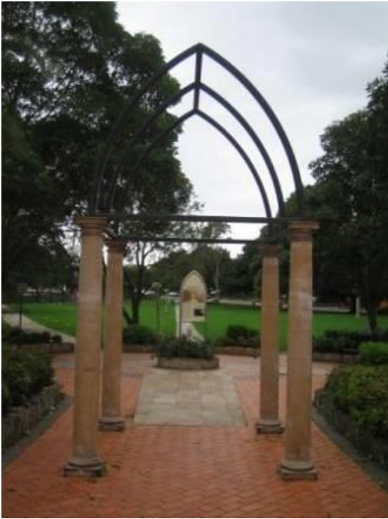
Figure 12 Heritage installation / gateway