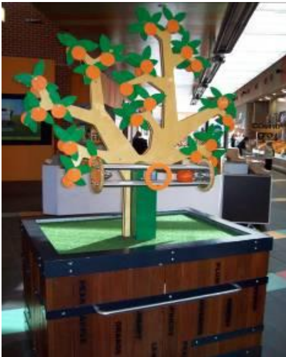
Figure 18 Interactive sculpture