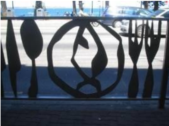
Figure 9 Streetscape custom fencing

Located along a restaurant and café strip and opposite the beach at Brighton Le-Sands, Sydney, this work sets the theme of food, eating and enjoyment, providing a less formal boundary between the footpath and road for pedestrians and motorists. It marks the area as a unique place and destination and as a place to remember.