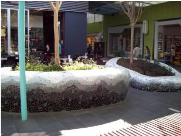
Figure 20 Custom designed garden-bed retainer