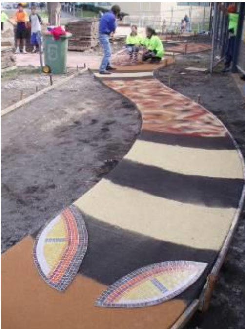
Figure 11 Integrated custom pathway