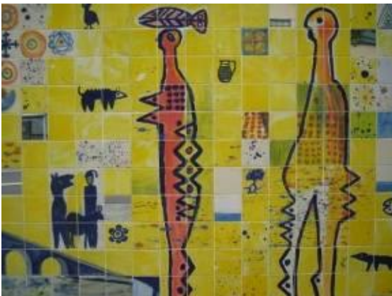
Figure 6 Ceramic mural