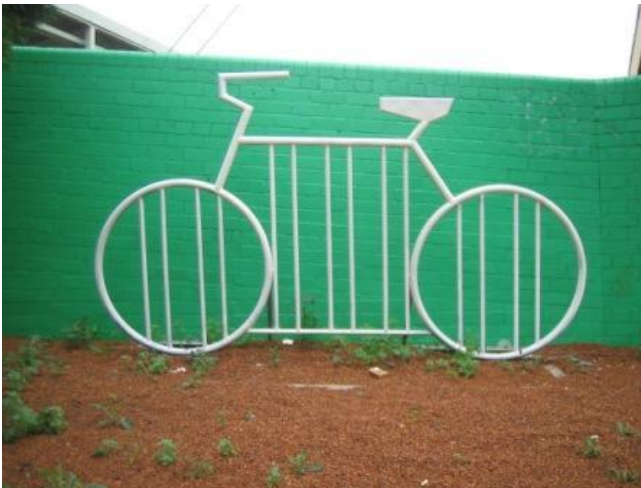
Figure 16 Custom designed utility