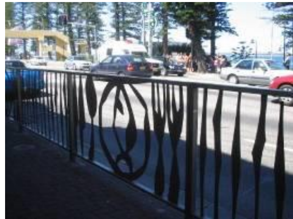
Figure 10 Streetscape custom fencing