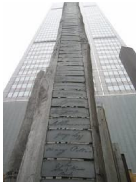
Figure 1 'The Edge of Trees'