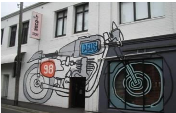
Figure 21 Mural graphic