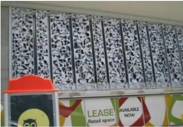
Figure 15 Façade treatment