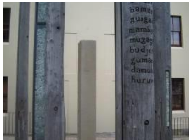
Figure 3 'The Edge of Trees'