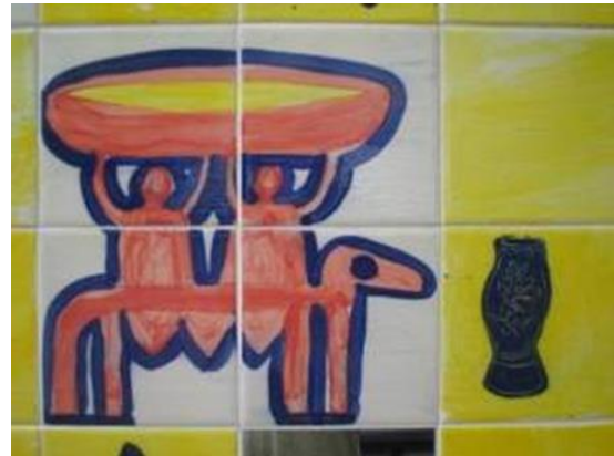
Figure 8 Ceramic mural