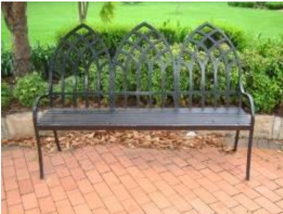
Figure 13 Heritage installation / gateway