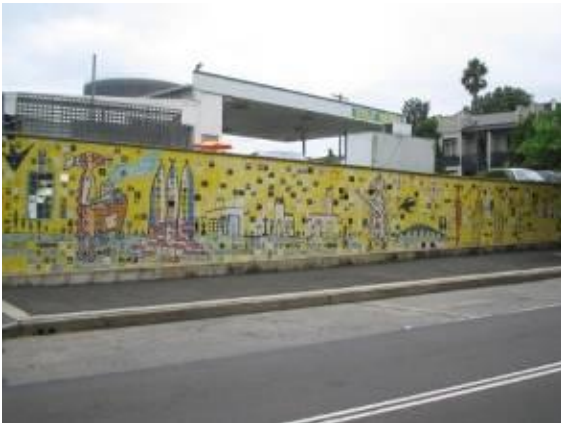
Figure 5 Ceramic mural

This mural was commissioned for placement opposite a Petersham café and restaurant strip frequented by many residents of migrant heritage, especially Portuguese. The mural was commissioned to commemorate the visit in 2002 to Marrickville of the Portuguese President and provides a definite identity to the street and is viewable from the shops opposite (see Figure 7).