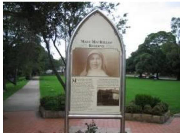
Figure 14 Heritage installation / gateway

As part of the City of Canterbury Heritage Program an unknown artist was commissioned to develop public art at Mary McKillop Reserve. The works resulted in the creation of an entranceway and resting place utilising custom designed components and interpretive signage, establishing the name and theme for a reserve whilst also being part of a 'heritage walk'.