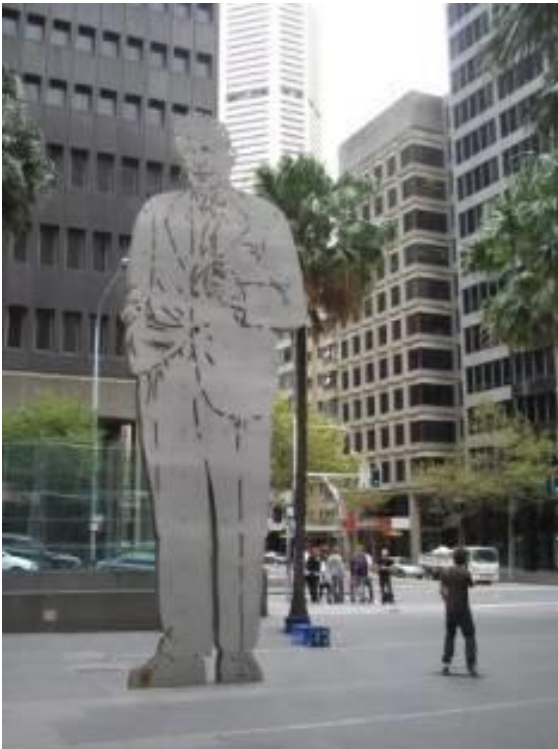
Figure 17 Single sculpture