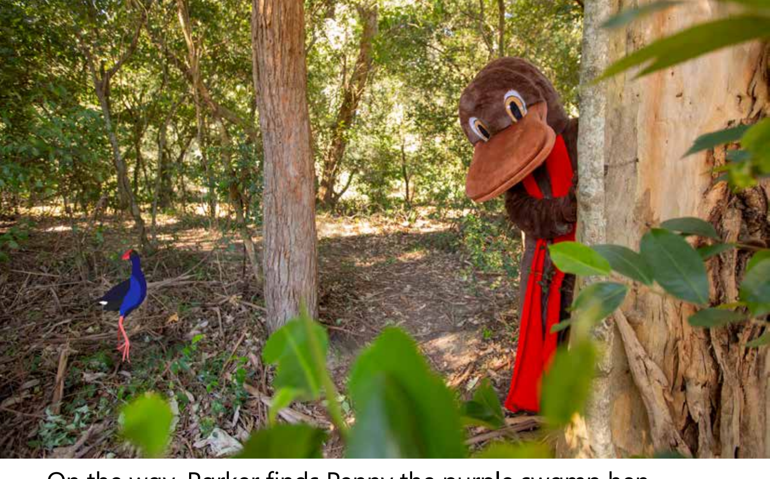
On the way, Parker finds Penny the purple swamp hen looking for food. "Hi Penny" they call.