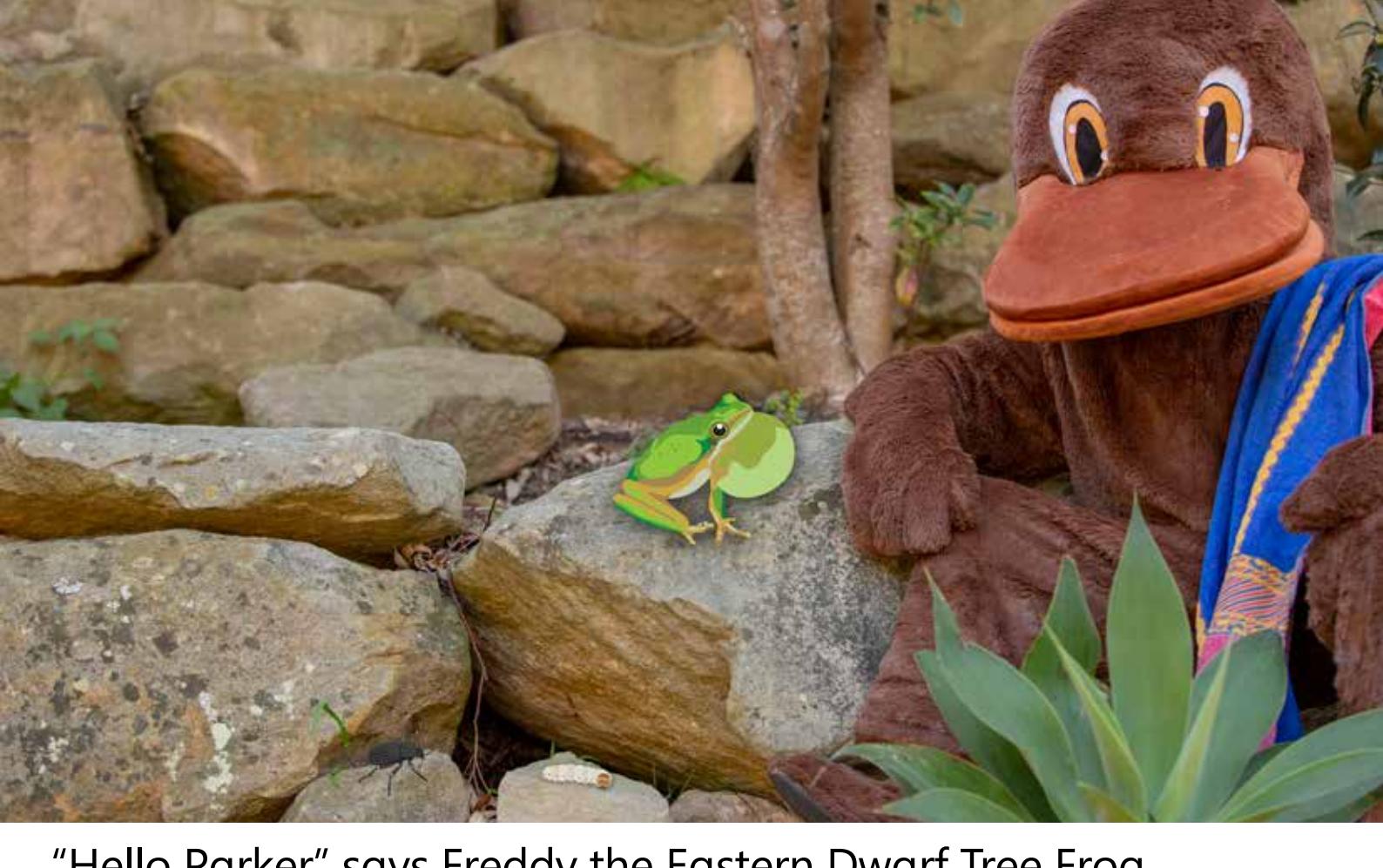
"Hello Parker" says Freddy the Eastern Dwarf Tree Frog. "Let's go find some friends to play with." "Great idea" says Parker.4