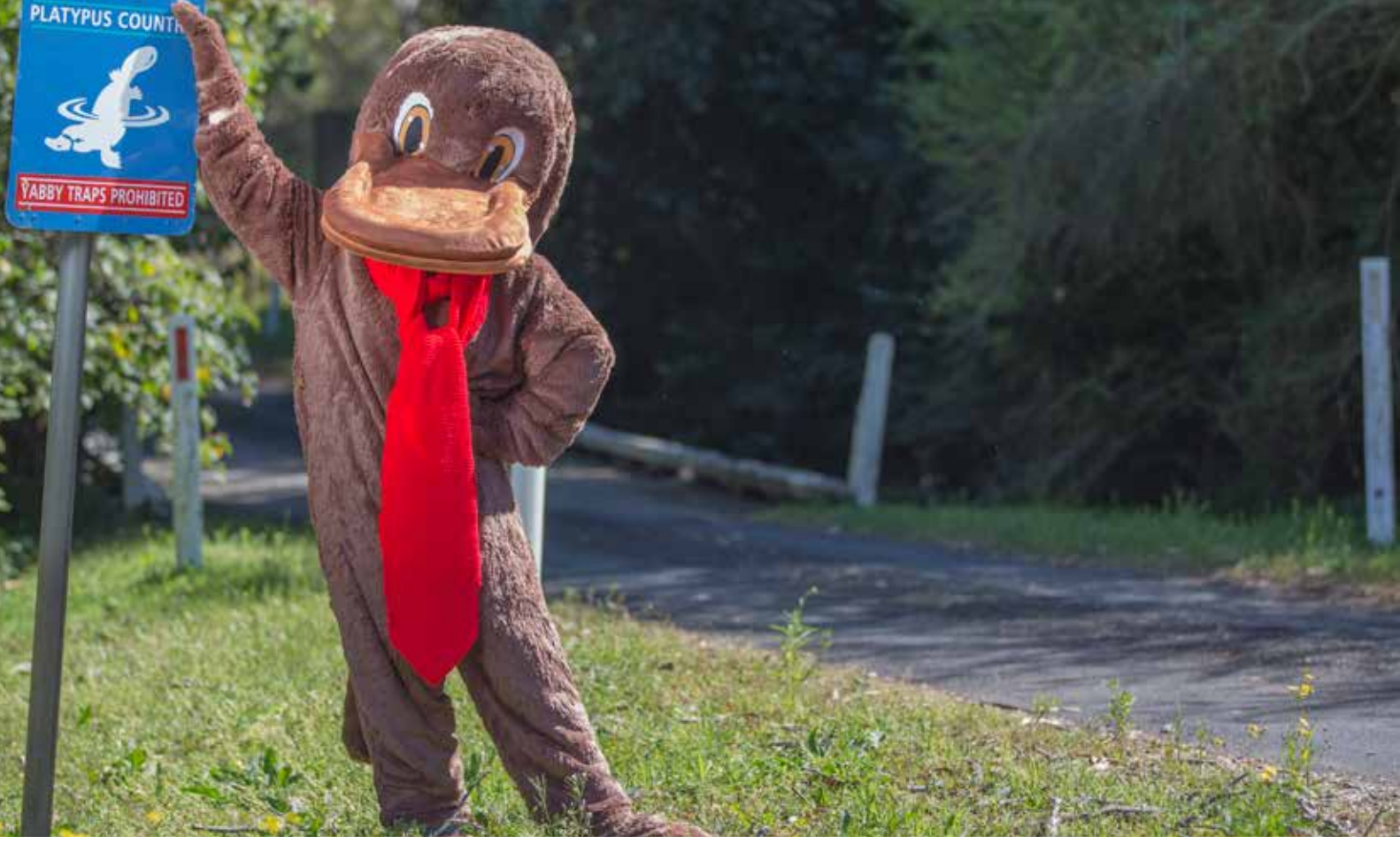
Parker lives in the beautiful waterways of the Central Coast. Many of Parker's friends live along the creeks and rivers.