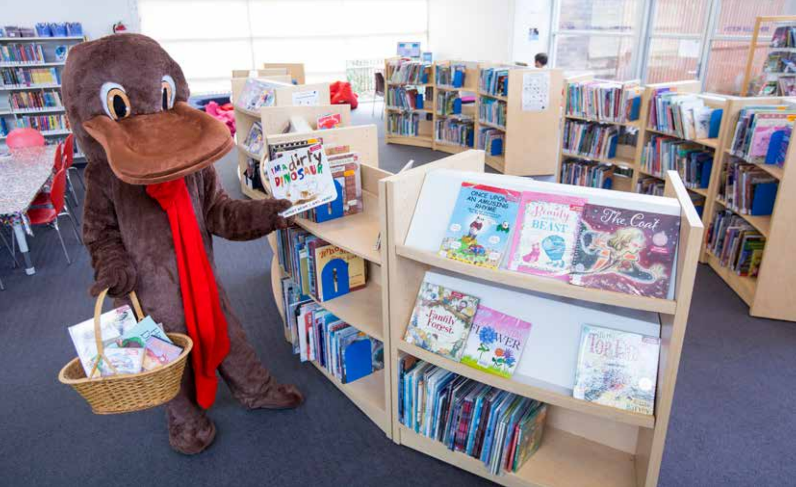
5 Parker finds a really good book about dinosaurs, a DVD and some other stories to borrow.