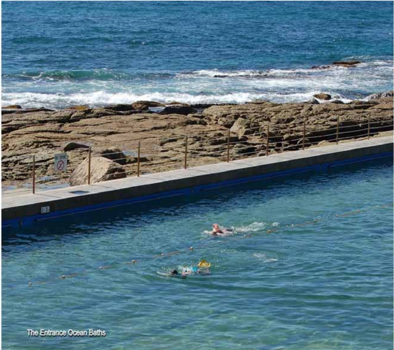
The Entrance Ocean Baths