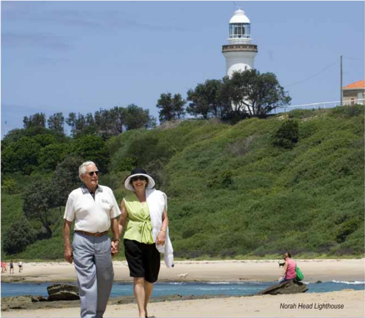
Norah Head Lighthouse