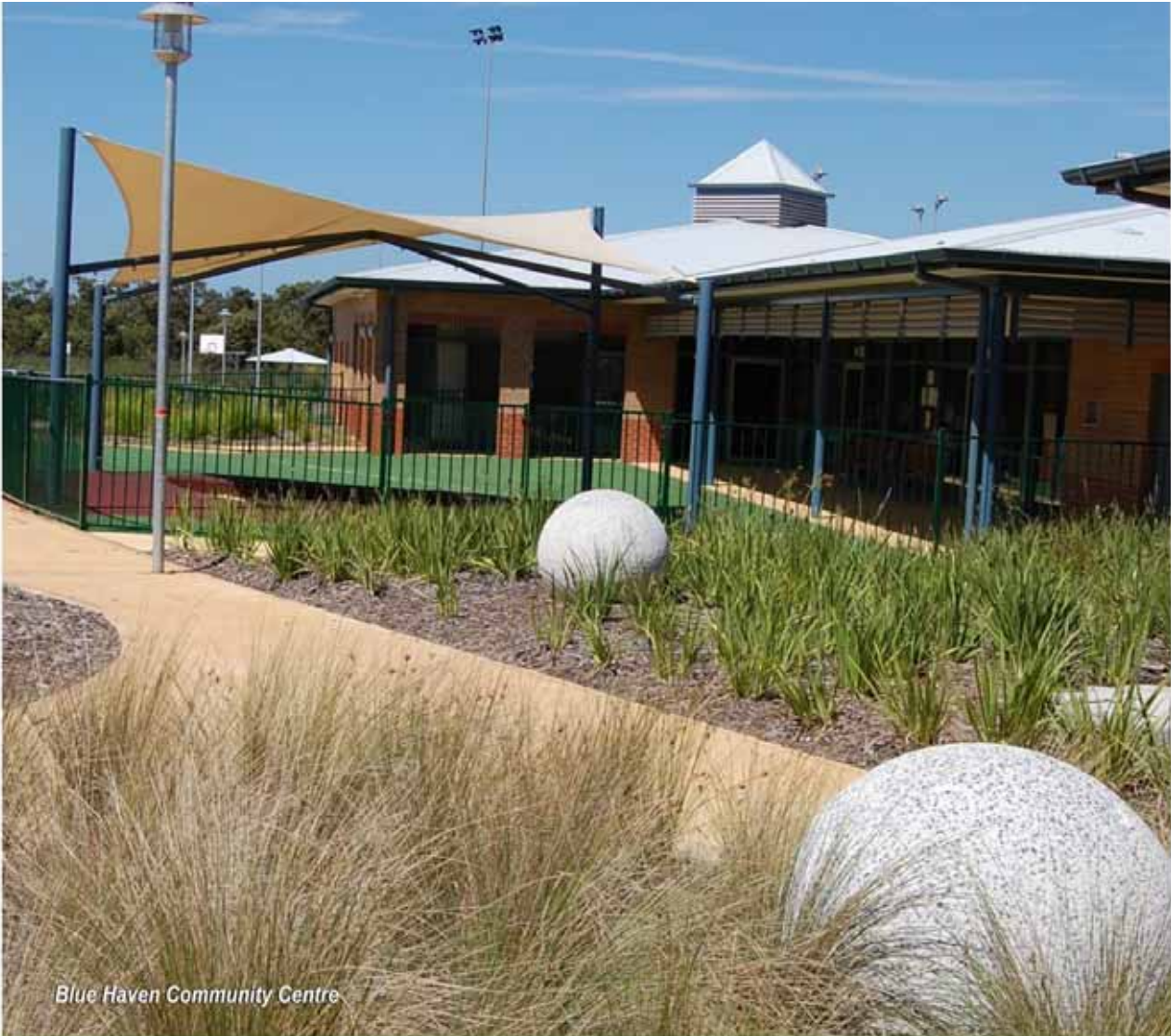
Blue Haven Community Centre