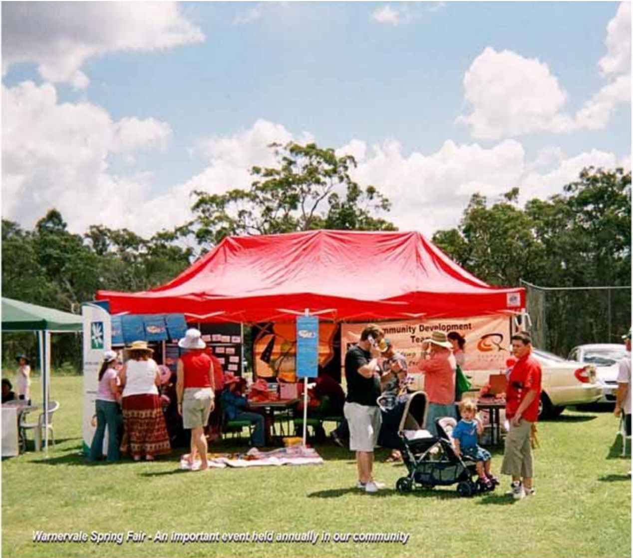
Warnervale Spring Fair - An important event held annually in our community