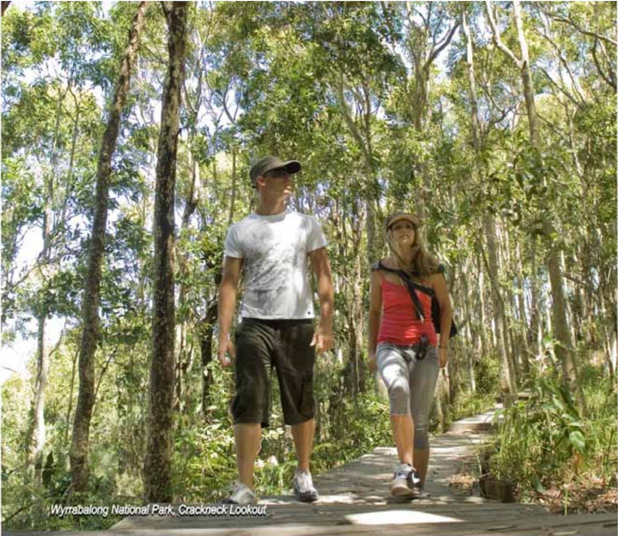
Wyrabalong National Park, Crackneck Lookout