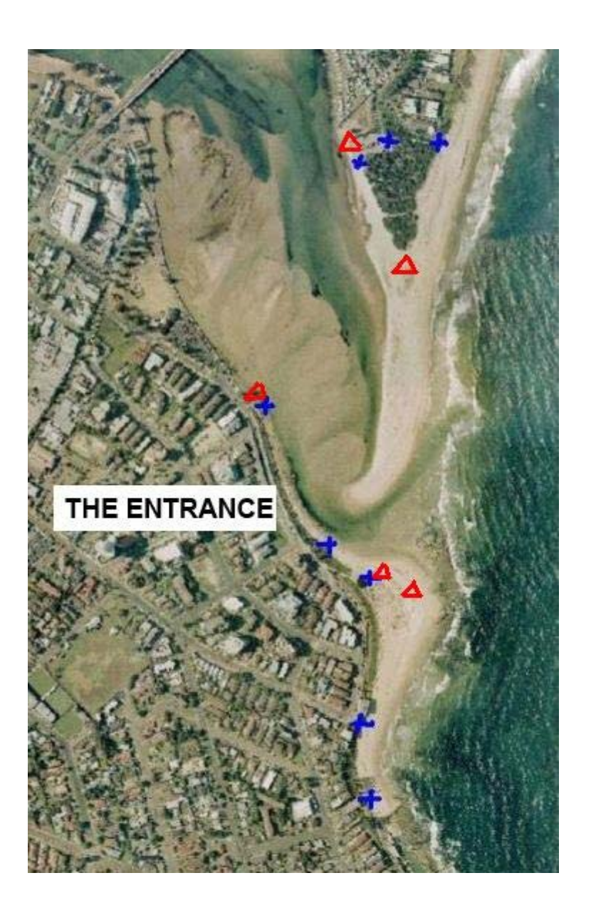
Figure 1 Location of Eight Proposed Supplementary Signs for The Entrance Estuary (♣) and Five Proposed Channel Area Dredge Signs (△)