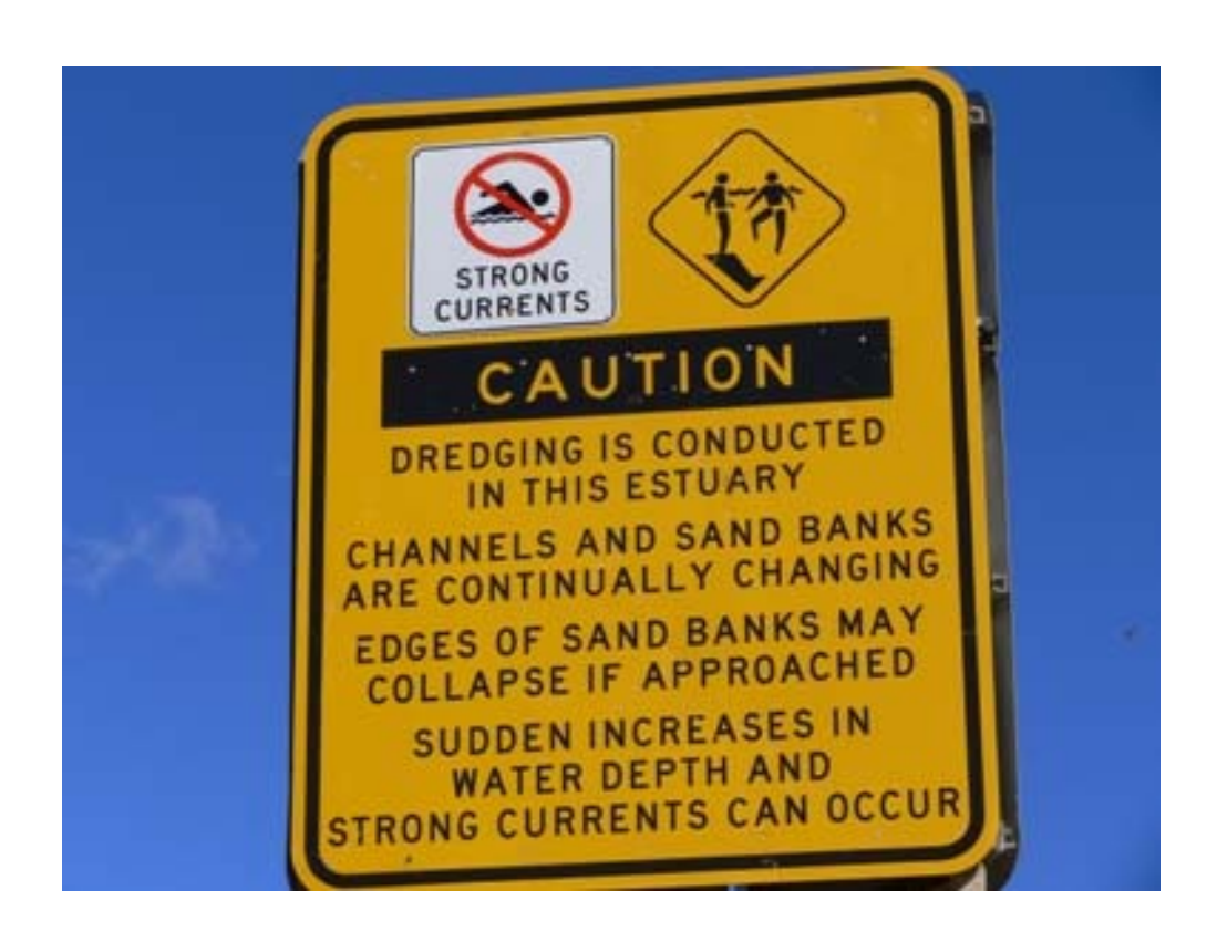
Figure 2 Existing Entrance Channel Dredge Warning Signs Erected Around the Estuary