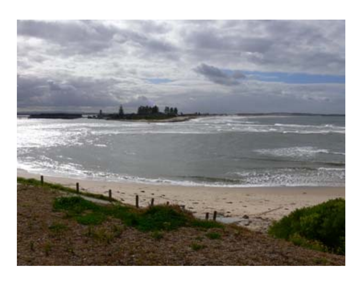
Figure 4 Entrance Channel at High Tide - 21 July 2007