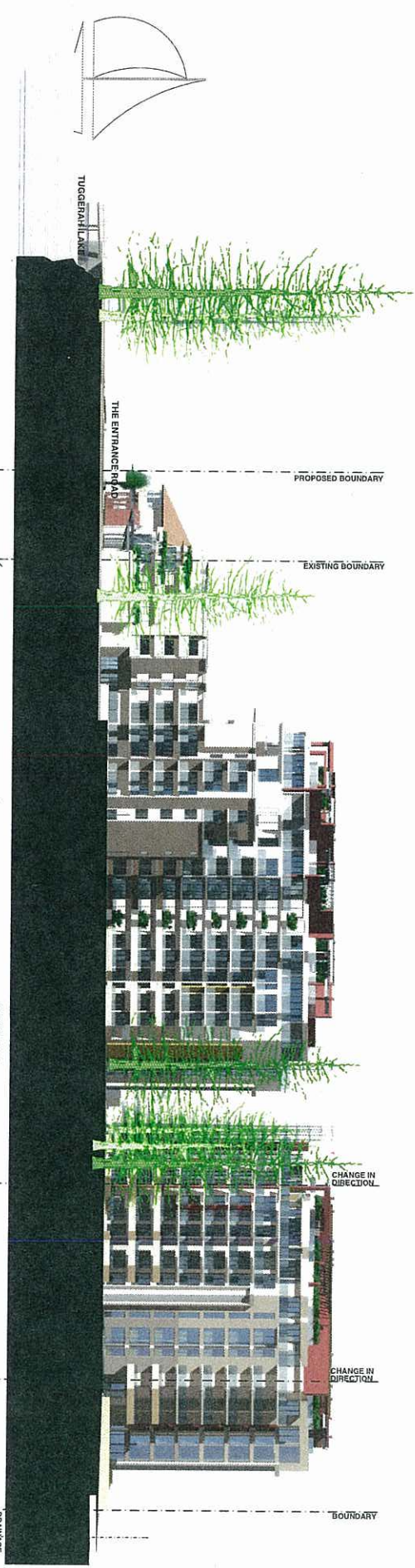
WESTERN SITE ELEVATION / VIEWED FROM - CLIFFORD STREET, LOOKING EAST SCALE 1:200

ROOF R-0.400 FLOORW/ET R-0.400 LEVEL 7 R-0.300 LEVEL 6 R-0.300 LEVEL 5 R-0.200 LEVEL 4 R-0.100 LEVEL 3 R-0.100 LEVEL 2 R-0.100 LEVEL 1 R-0.100 UPPER GROUND R-0.100 LOWER GROUND R-0.100 BASEMENT R-0.100 R-0.100