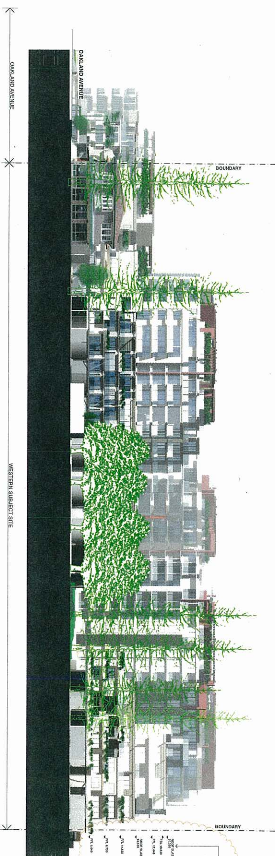
NORTHERN SITE ELEVATION VIEWED FROM- TUGGERAH LAKE, LOOKING SOUTH SCALE 1:200