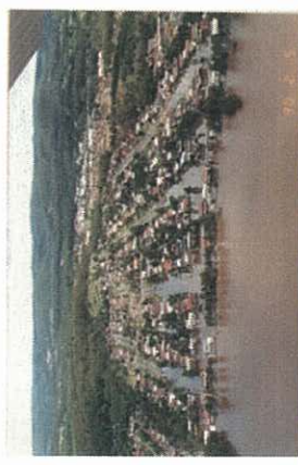
Photo 7: Berkeley Vale: Wombat, Black Swan St & Albatross, Platypus Rd