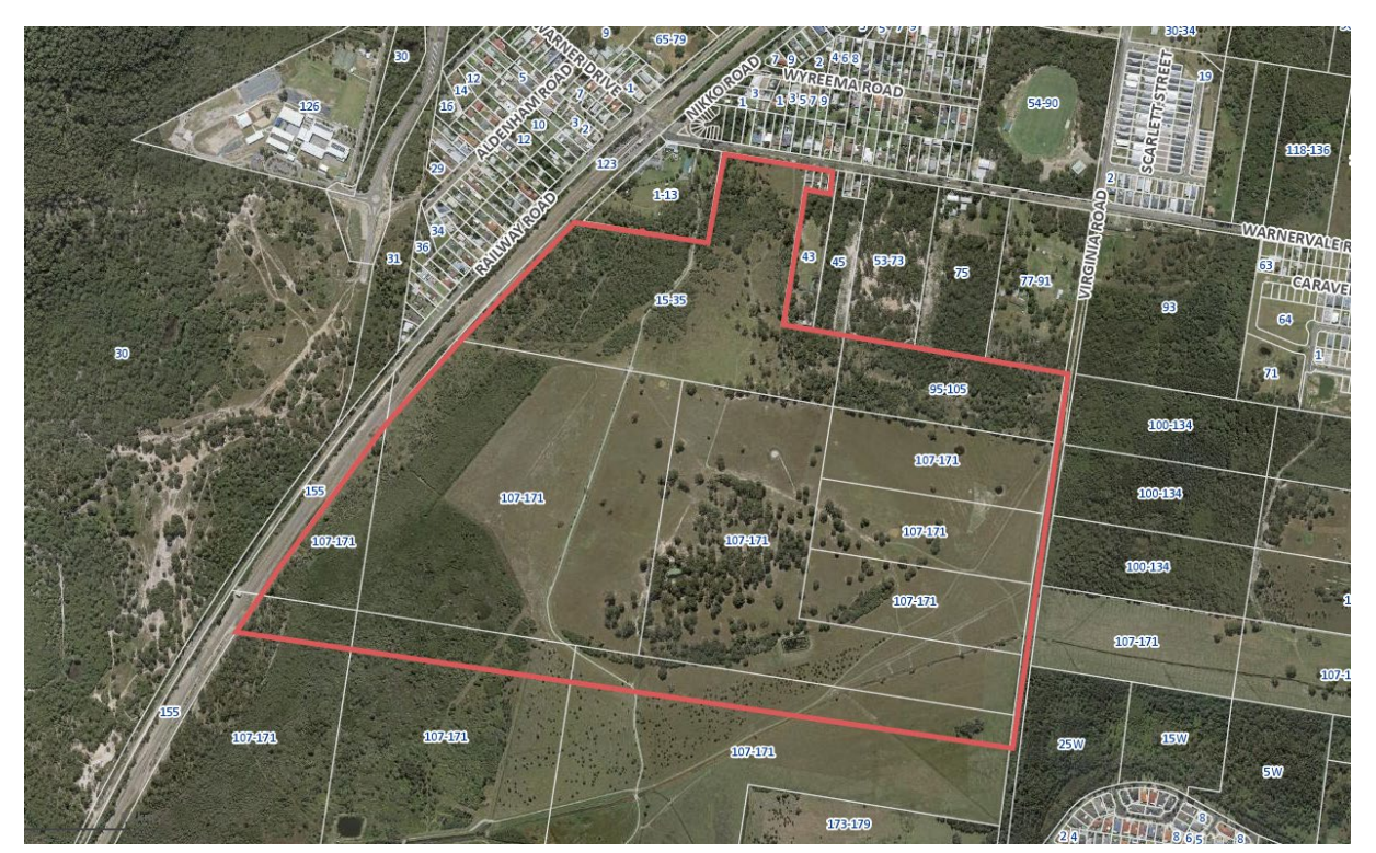
Figure 1 – Site Area

The site is being developed by AV Jennings, a development consent has been issued for stage 1 (5 lots) and for stages 2A and 2B on the 3 July 2020. The development consent for stages 2A and 2B is for subdivision (158 residential lots, 1 commercial lot, 14 residue lots and wildlife corridor). A copy of the approved subdivision is provided below.