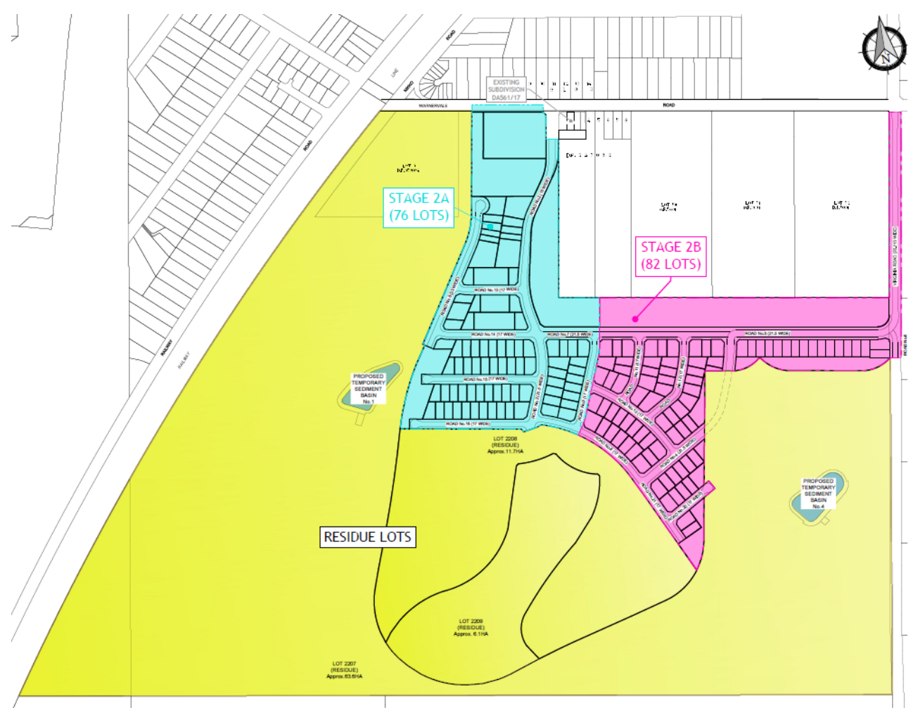
Figure 2 – Approved lot layout Stages 2A and 2B (AV Jennings)