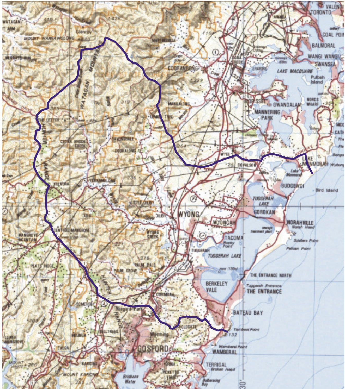
MAP WITH COMPLIMENTS OF AUSLIG